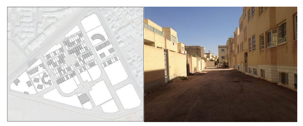
Fig 3. Case study No. 2: Silu