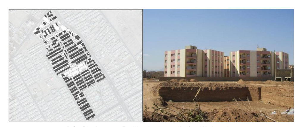
Fig 2. Case study No. 1: Imamshahr 6th district