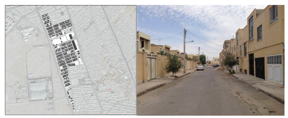
Fig 4. Case Study No. 3: Kowsar Safaiyeh