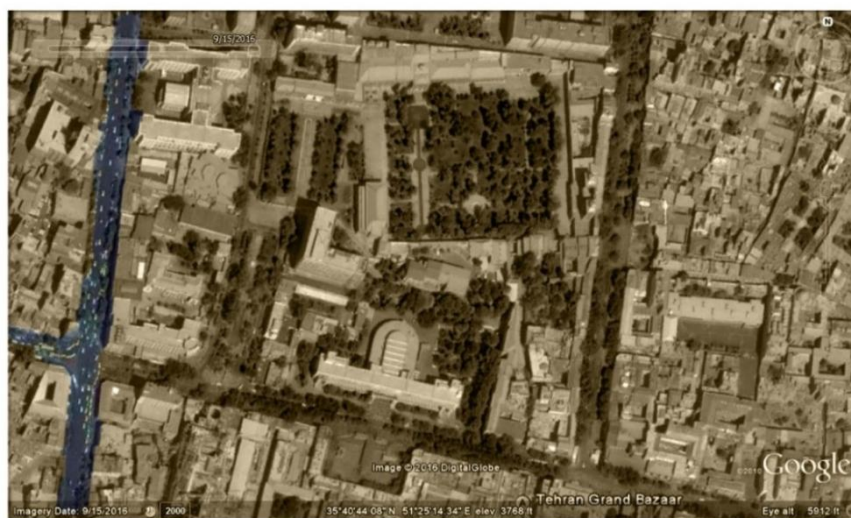
Fig. 3 Aerial photo of the site on 15.09.2016 after completion of the pedestrianisation project in the whole area