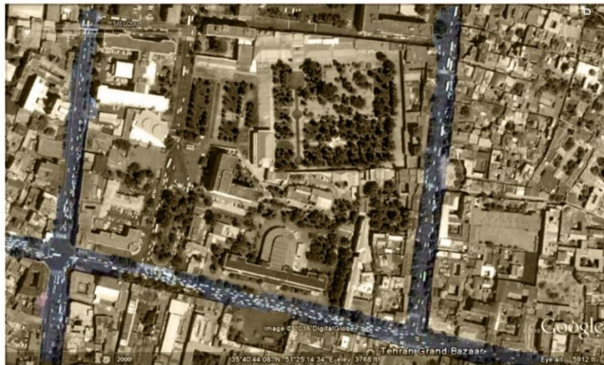
Fig. 2 Aerial photo of the site on 31.05.2008 before pedestrianisation project

Tehran historic centres are the main parts of the socio-cultural, political and economic activities of this city. Due to the importance of the site, this area is still a priority for the Tehran municipal activities. The improvement project of this site includes pedestrianisation, street lighting, expansion of the public spaces, renovation of facades, improving the flooring and pavements, expansion of the bazaar and improvement of the urban facilities. The process was started in 2002, while the pedestrianisation project of Panzdah Khordad Street was launched in 2008. Following pictures show the development of the project from 31.05.2008 to 15.09.2016 Figs. 2-3 [23].