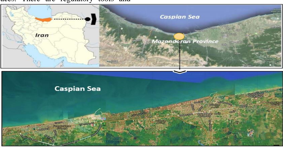
Fig. 1 Location map of the case study

Mazandaran Province has the area about 24000 km2 and 3milion population. Because of its geographical location and climate situation, there are more than 12 million tourists visiting the shoreline annually. However, there are limited open spaces along the shoreline because of the increasing trend of privatization of public coastal spaces in the form of gated communities. The case study in this research is the coastal urban area in the middle part of Mazandaran Province which includes two main coastal cities of Babolsar and Fereydun-Kenar and their surrounding areas encompassing agricultural lands, rural areas and regional recreational complexes.