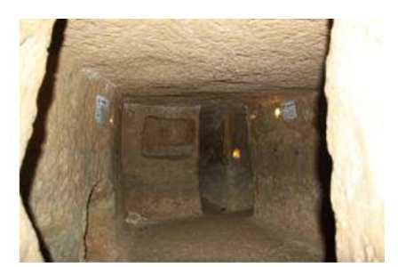
Fig. 3 Ouyi Underground City