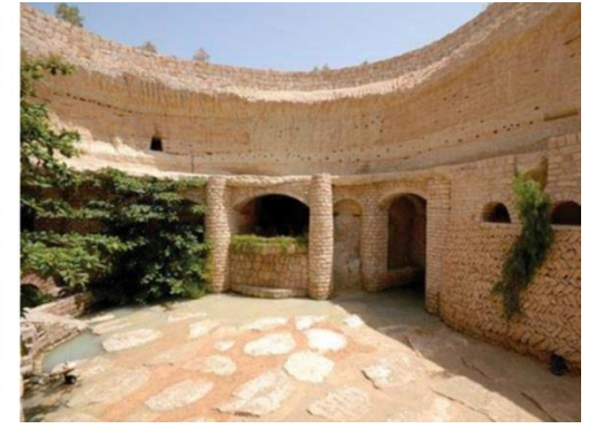
Fig. 2 Kariz Underground City

Nushabad: Ouyi underground city has been architected in three levels and dug to 20 meters deep. Entrance of this underground city is a narrow hall, in the size of one person, when you enter the inside of the city, the smell of moist soil is felt. This underground town was created in three levels in depth of 4 to 21 meter from the ground surface. Area of this town was mostly for connection between Neighborhoods and to protect life and property of people in unsafe situations and has been spread both horizontally and vertically.