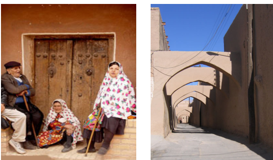
Fig. 1. Platforms (Pīrneshīn) at the entrance of buildings and routes in desert villages.

With relation to design and construction of traditional neighborhoods, examples of inclusive design which have roots in Islamic ideology can be observed in urban environments. For instance sitting platforms (Pīrneshīn), slope surfaces of roads and alleys have been measured in order to help people who are physically restricted (Fig. 1). It would be apposite to