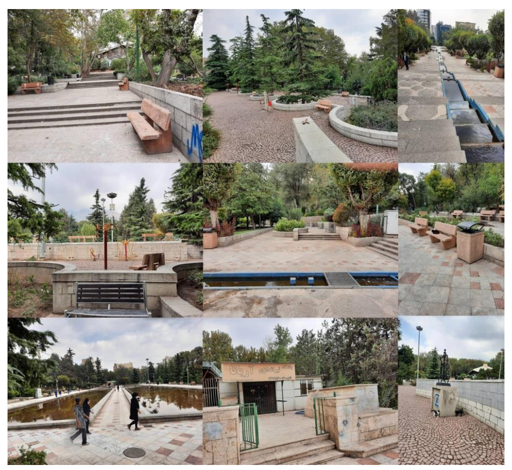
Fig 2. Niavaran Park