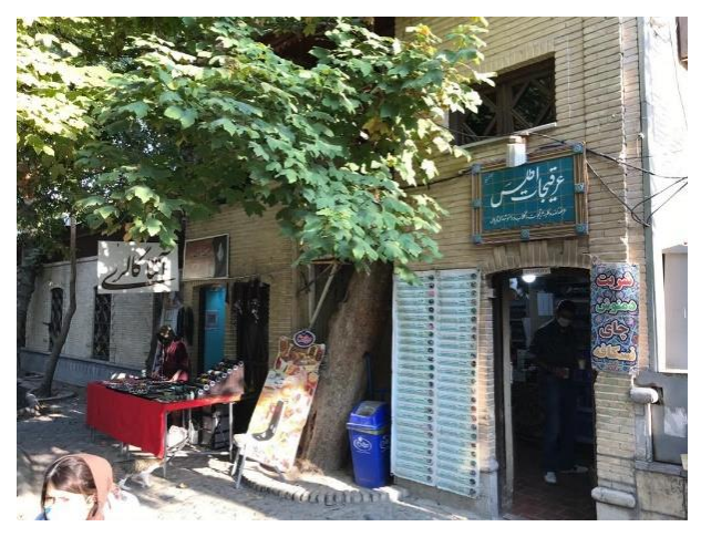
Fig 7. Nations market – Qeytariyeh

Table 4. Attitudes of Park users about the impact of the park on environmental effects