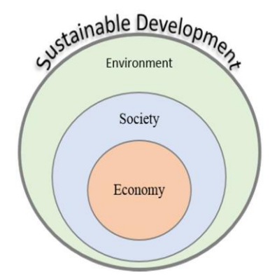
Diagram 1. The interrelation between the main elements of sustainable development (Khaleghi, 2019)

safekeeping. The last domain is socio-cultural and has the goal to increase the human scale of urban spaces with a relationship between social interaction and culture. (Nadarajah, 2006) The importance and necessity of sustainable public spaces in a city have roots in the effort of the global environment to change macroscopically. Countries are increasingly interested in following universal agendas in an attempt to improve the quality of public spaces (Nadarajah, 2018). In summary, the components of sustainable development of urban spaces include 3 main categories: physical, cultural, and ecological subjects. (Kim, 2014)