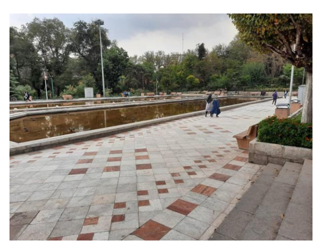
Fig 9. One of the Large pools in Niyavaran

The main concerns in each study were the engagement of women in physical activities and low employment rates due to parks and surrounding businesses. For example, the creation of new jobs is the only component of the study that scored below 50 percent, and near 10 percent in the final analysis. These concerns should be considered for park design, maintenance, and future improvements.