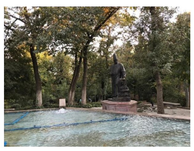
Fig 8. View of fountain in Qeytariyeh