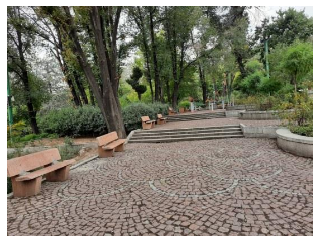
Fig 4. Perspective of Niyavaran park