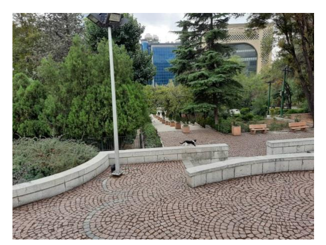
Fig 6. View of Niyavaran palace