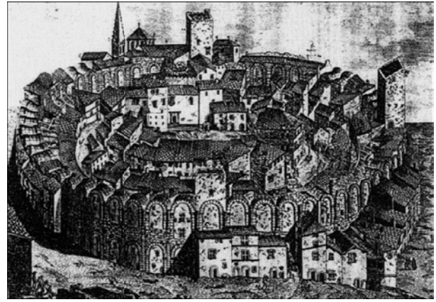
Fig. 1. An image of a compact city; Source: [44]

integration of land uses, for some degree of "self-containment" [31]. Newman and Kenworthy (1989) also demand more intensive land use, centralized activity and higher densities.